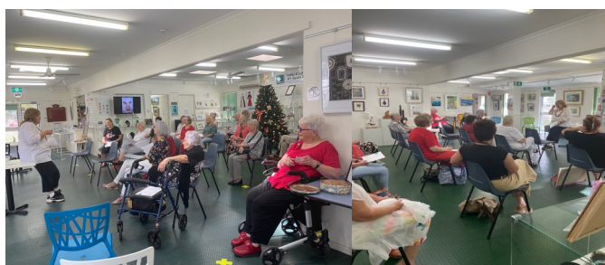
Photo's from the December General meeting

The first meeting for 2021 will be Monday 1st February 10am-12pm, we look forward to seeing many of you then.